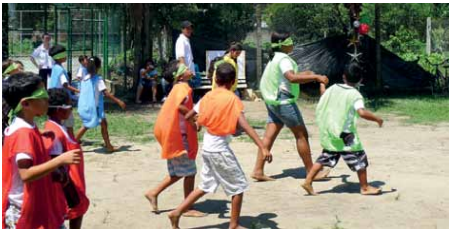
Children from FEBEME, an after-school care centre in Angra dos Reis, Brazil, were treated to fun and games in a telematch organised by volunteers from Keppel FELS Brasil's BrasFELS yard

spirit of volunteerism, and that the efforts have brought a big smile to the children's faces.