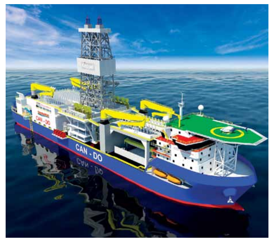
The CAN DO drillship, with its large functional deck space and next generation 20,000 psi blowout preventers, is poised to be the front runner in deepwater exploration, development and completion drilling

Following positive feedback and strong enquiries from the market, Keppel FELS is proceeding with the building of its new CAN DO drillship, a proprietary design differentiated from current offerings. When completed in 2016, the drillship is expected to be a state-of-the-art deepwater exploration, development and completion drilling vessel.