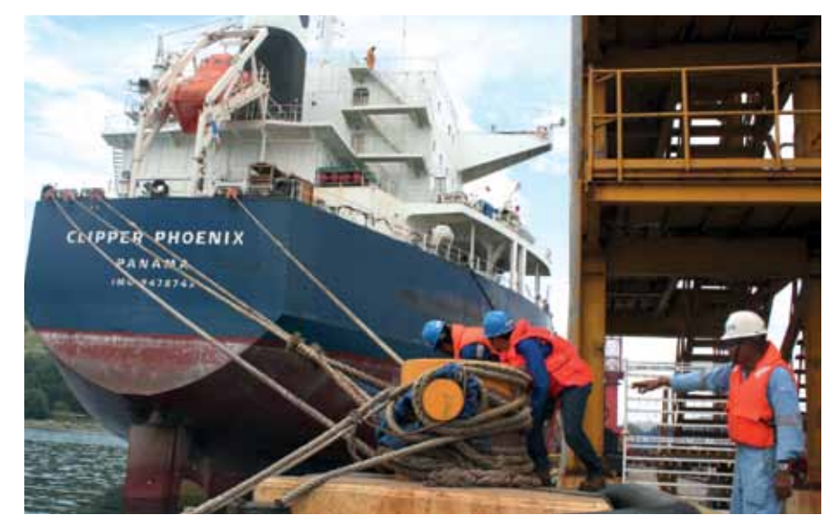
The shipyards' typhoon watch groups ensured that the vessels were secured to the docks to prepare for Typhoon Haiyan

of the typhoon. These standard operational procedures have been in place since Keppel started operations in these yards.