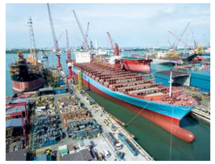
The 366-metre container ship from A.P. Moller-Maersk, Mette Maersk, was the first vessel to benefit from the extension of Raffles Dock to 400 metres

Catering to the increasingly diverse needs of its global customers, Keppel Shipyard has lengthened Raffles Dock at its Tuas Yard, Singapore.