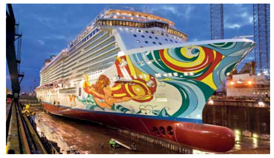
Norwegian Getaway added a splash of colours to the yard when it docked in Keppel Verolme for an inspection job

innovative cruise ship owned by Royal Caribbean International.