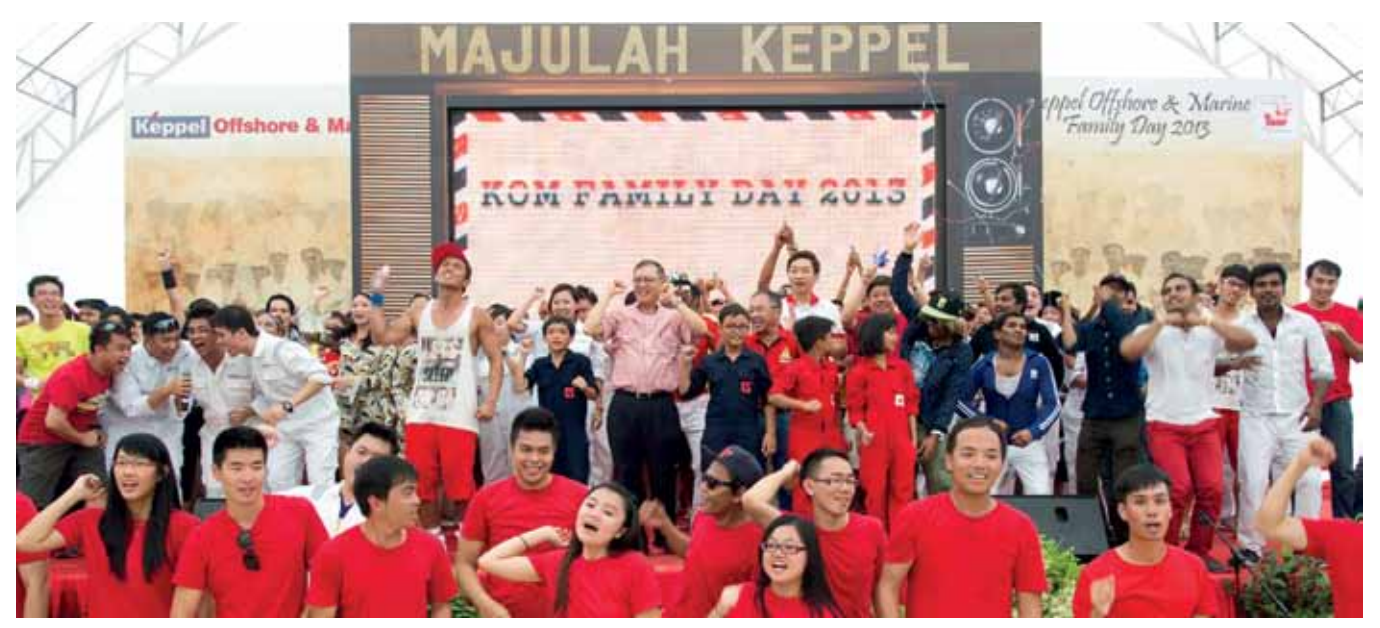
Employees gathered on 1 December 2013 for Keppel O&M Family Day and revelled in music and dance

Throughout the year, Keppel Offshore & Marine (Keppel O&M) regularly rolls out programmes to promote better health and wellness amongst employees. December 2013 was no exception.