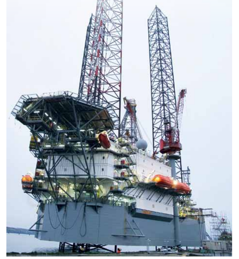
ENSCO 120, an ultra-premium harsh environment jackup built to the KFELS Super A Class design, arrived in Dundee, UK, in October 2013 for commissioning before moving to the North Sea for deployment by Nexen

"Customers come to us because we have the experience and expertise to provide solutions that can meet their needs. We are able to stay ahead of the competition because we have the research and development resources and