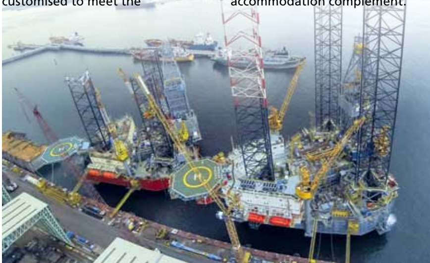
The KFELS Super A Class jackup rig design is establishing its reputation in the market with its versatility, reliability and capabilities

Mr John T. Rynd, CEO of Hercules Offshore, said, "These rigs are among the world's most elite jackup drilling rigs. The KFELS Super A Class rig provides higher variable load, better drilling capabilities and cantilever load performance as well as a larger deck space and superior accommodation complement.