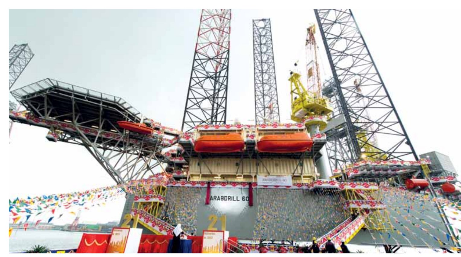
The delivery of ARABDRILL 60, the 21st rig delivered by Keppel FELS in 2013, sets a new record in a milestone year for Keppel

Keppel FELS delivers 21 rigs in 2013, setting a record for the most number of offshore rig deliveries by a company in a single year.